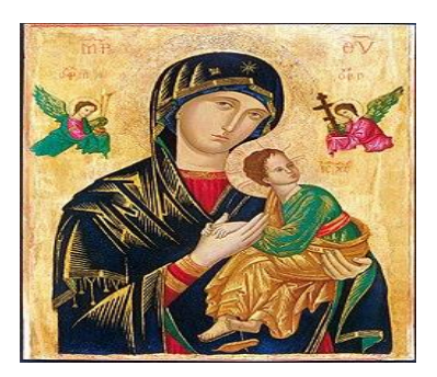
First Day Mother of Perpetual help Remove the Consequence of the Sins of My Past

The consequences of sins committed can do so much damage in the life of a person. Sins can be forgiven but the harm it incurs can hunt the person who committed it till death. An example can be seen in 2Samuel 6 vs. 20, when David's wife, Michal, rebuked David because of the way he danced before the lord. As a result of that, the Lord the giver of Children, refused to give her a child till she died (2Samuel 6 vs. 23).